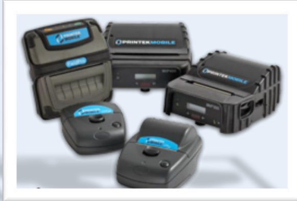
Printek's line of rugged printers are an important part of the HarvestPay system

Printek specializes in ruggedized printers. Their printers have become an important part of our system for several reasons. Printek printers hold up very well to the extreme agriculture work environments that we subject our equipment to. Not only are these printers tough, they also provide flexibility thanks to integrated features such as barcode scanning and magnetic card readers for our system ID cards. Bluetooth and Wi-Fi connectivity give us