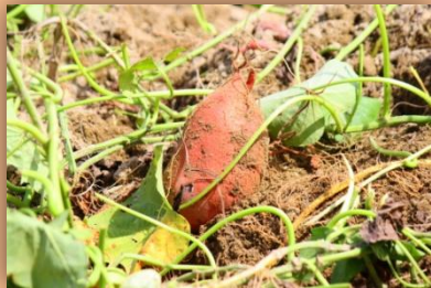
Rocky Mount, NC Sweet Potato

It's Fall and that means Thanksgiving is right around the corner. One popular food that will be on many Thanksgiving Day dinner tables is Sweet Potatoes. You've probably noticed on restaurant menus in recent years that sweet potatoes aren't just for Thanksgiving anymore though. According to "The Packer": demand for sweet potatoes has "increased by up to 500% after