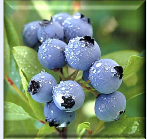
Citrus Harvesting, Sweet Corn Harvesting, Onion Harvesting, Corn De-tasseling, Sugar Cane Planting, Watermelon Harvesting, sweet potatoes, and now...BLUEBERRIES!

start and stop times as well as recording individual worker's bucket dumps. That data is then easily uploaded to our HarvestPay website so that the data can be verified and imported into the customer's payroll processing system. We are really excited to add blueberries to our growing list of crops that will utilize HarvestPay to streamline their payroll data collection and ensure accuracy and compliance.