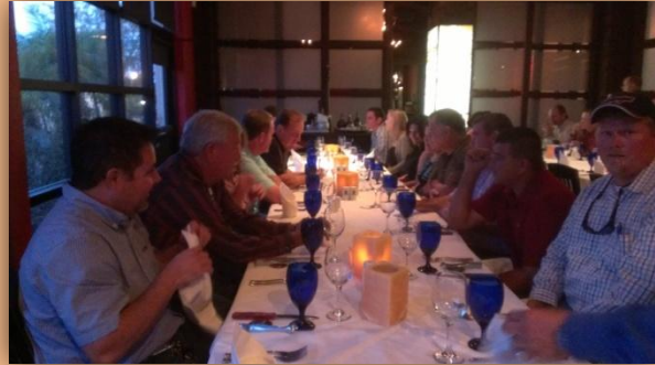
A great meal with great people...